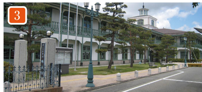
Takayama City Library