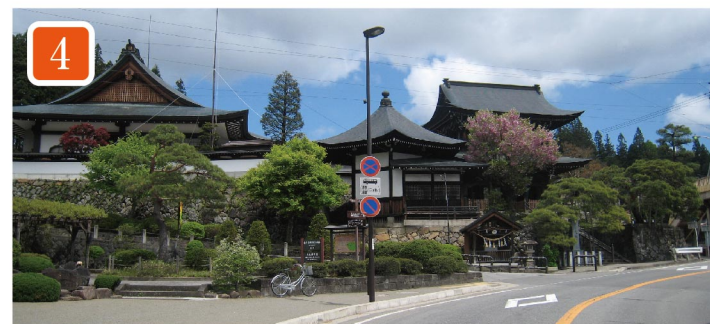
Front of Daiouji Temple