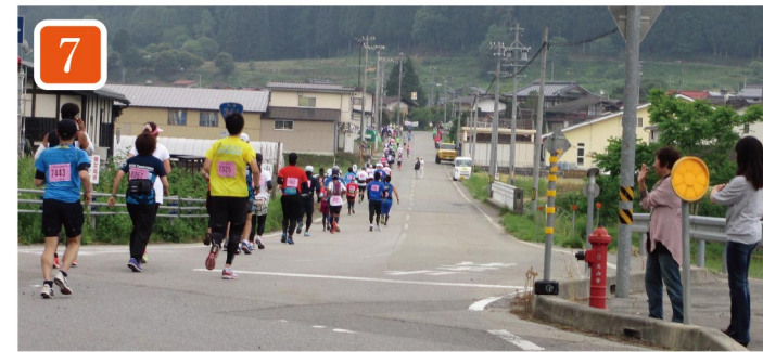
Toward Mountain Area