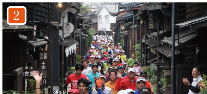
Old Private Houses (Furui Machinami )