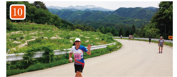
Runners with Mt. Norikura in Background